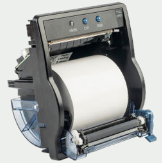
NAUT324C open door