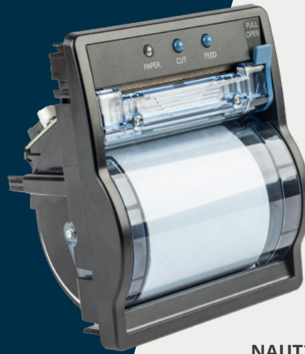
NAUT324C closed door

It is suitable for a wide range of applications, including POS terminals, banking devices, measurement instruments, medical, and industrial equipment.